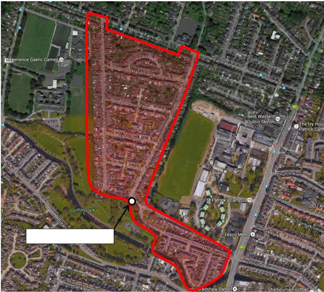
Figure 2: Houses within close proximity of the proposed road closure

The location of submissions made was analysed to obtain a general feel for how the residents of those locations have responded to the proposals.